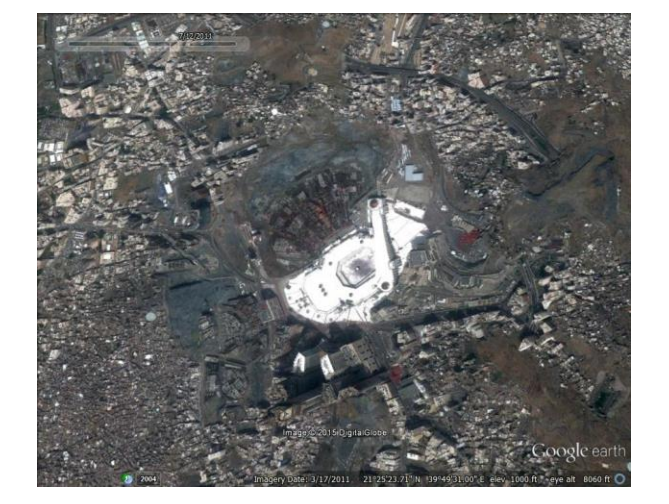
Mecca – 2011

Americans for Democracy & Human Rights in Bahrain 1001 Connecticut Ave NW, Suite 205 • Washington, D.C. 20036 • (202) 621-6141 • www.adhrb.org • @ADHRB