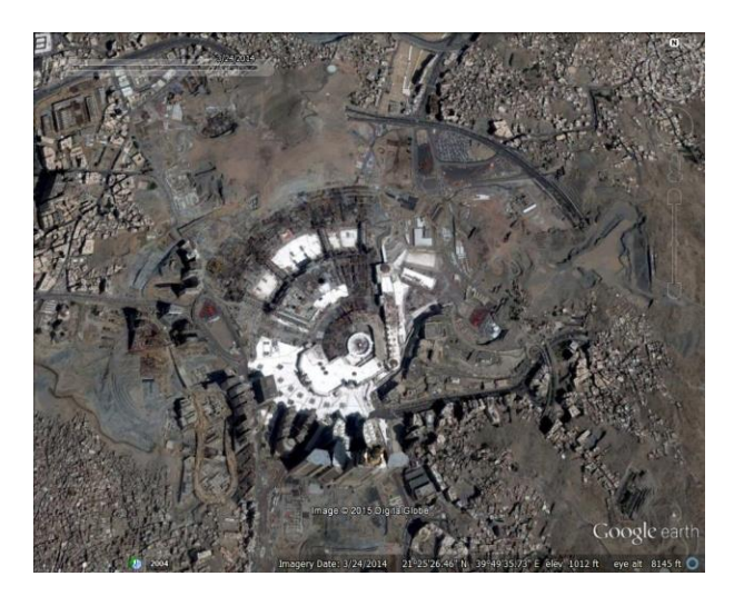
Mecca – 2014